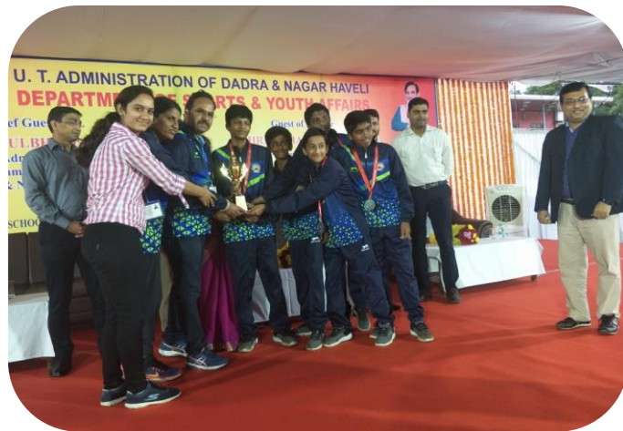
SGFI 3 RD PLACE CHESS UNDER-14 BOYS